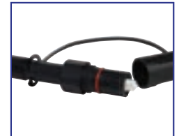
HDC FULLY COMPATIBLE OptiTap® STYLE HARDENED SOLUTION