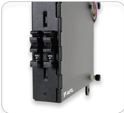
WME01 rear mounting clip for DIN rail

AFL's wall mount interconnect enclosure (WME01) provides a convenient convergence point for interconnecting and/or splicing in wall mount applications. Provisioned for one LGX-compatible adapter plate or optical module, the enclosure features a well-engineered solution for fiber and cable management on both the top and bottom openings of the enclosure. Robust steel construction ensures the highest level of protection for sensitive components while integrated roll-formed hinges eliminate possible fiber pinch points. The WME01 features a front access door which is lockable with a common pad-lock or tube-style keyed lock.